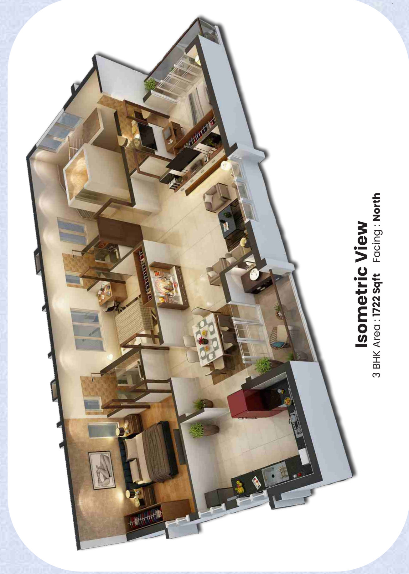
Isometric View 3 BHK Area : 1722 sqft Facing : North